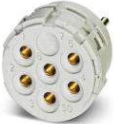
Contact insert, Number of positions: 6+3, Type of contact: Socket, Solder-in connection

Please be informed that the data shown in this PDF Document is generated from our Online Catalog. Please find the complete data in the user's documentation. Our General Terms of Use for Downloads are valid ( http://phoenixcontact.com/download )