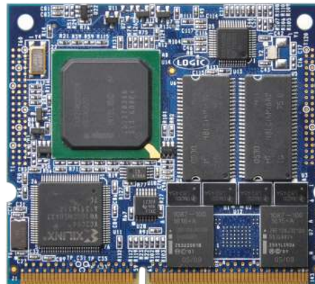
PXA270 CARD ENGINE

The PXA270 Card Engine is ideal for applications in the medical, point-of-sale, industrial, and security markets. From patient