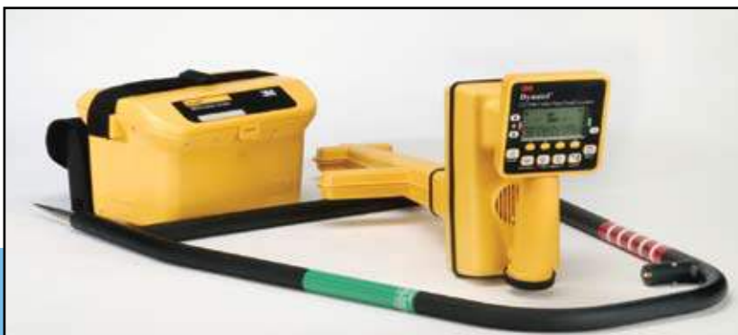
3M™ Dynatel™ Cable/Pipe and Fault Locator 2273M