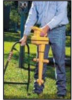
3M™ Dynatel™ Cable/Pipe and Fault Locator 2273M

The receiver also accommodates four user-definable auxiliary frequencies and allows the user to perform a self-calibration operation at any frequency at any time. With the easy-to-use configuration tool, users can enable or disable any of 22 frequencies.