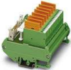
Fuse module with LEDs (for digital input cards of the Delta V control system)

Please be informed that the data shown in this PDF Document is generated from our Online Catalog. Please find the complete data in the user's documentation. Our General Terms of Use for Downloads are valid ( http://phoenixcontact.com/download )