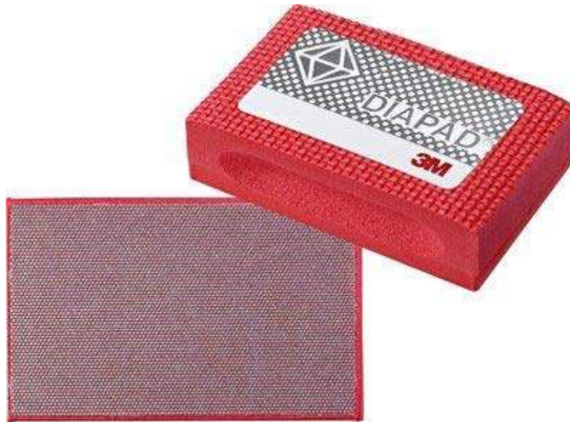
Portable abrasive makes finishing hard-to-reach areas achievable