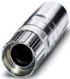
Sleeve housing for cable connector, straight, Screw locking, M23, Shielded: Yes, Cable cross section: 6.5 mm...14.5 mm

Please be informed that the data shown in this PDF Document is generated from our Online Catalog. Please find the complete data in the user's documentation. Our General Terms of Use for Downloads are valid ( http://download.phoenixcontact.com )