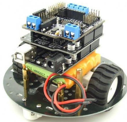
MiniQ with Motor Shield, DFRduino and expansion shield.