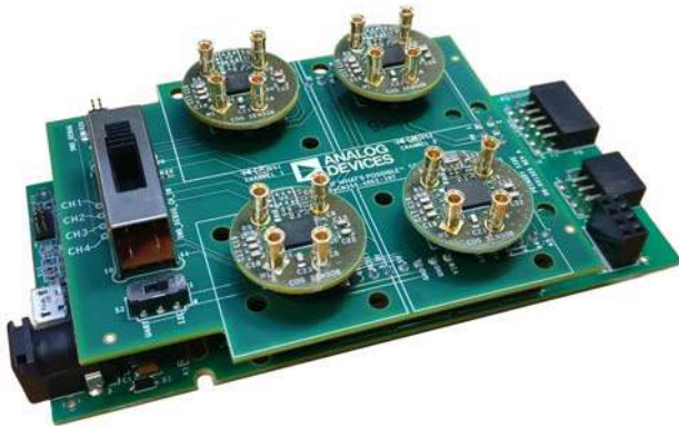
Figure 4. System Setup— EVAL-ADICUP3029 with Four Gas Sensor Boards Connected

The example code for the EVAL-ADICUP3029 provides a simple user interface by means of a virtual COM port between the EVAL-ADICUP3029 microcontroller and the PC. The user interface can be accessed using a serial port terminal application like TeraTerm. This interface enables the user to configure the sensor and read the sensor data. Further information about the operation of this user interface can be found in the CN-0429 User Guide .