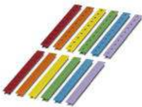
The illustration shows various versions of the article

Please be informed that the data shown in this PDF Document is generated from our Online Catalog. Please find the complete data in the user's documentation. Our General Terms of Use for Downloads are valid ( http://phoenixcontact.com/download )