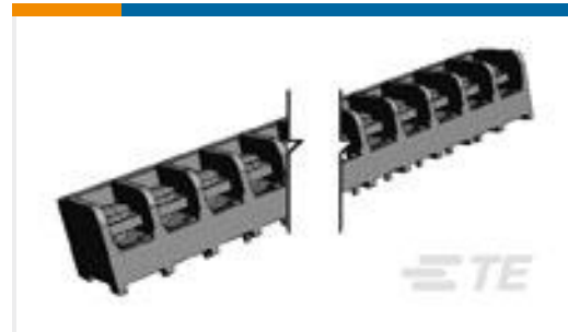
TE Part #8-1437653-0 6PCV-16-006=6PCV ASSEMBLY