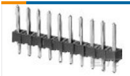
TE Part #5-146280-5 05 MODII HDR SRST B/A .100CL