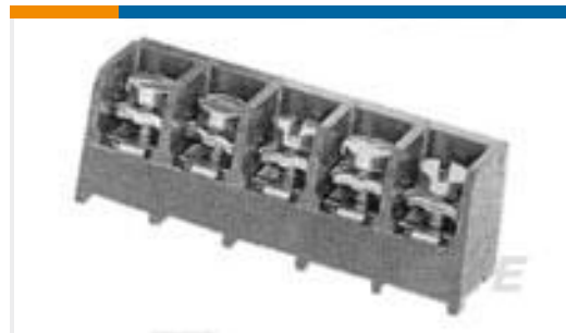
TE Part #4-1437655-5 6WWW-03-008=#6 TRIBARRIER TERM