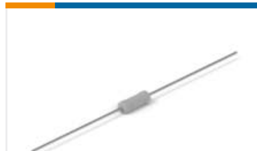
TE Part #9-1676123-1 1/2W SM M/OX 5% 4K7