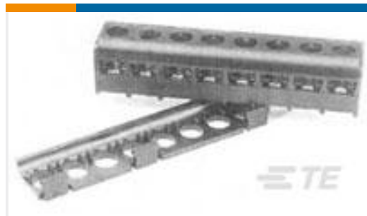
TE Part #2-1437661-9 TC6-03-PFH=COVER w/HOLES