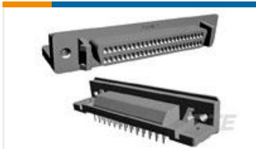
TE Part #5787394-7 68 50SR R/A RCPT ASSY, LD FREE