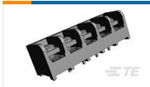
TE Part #8-1437652-2 6PCV-05-006=6PCV ASSEMBLY