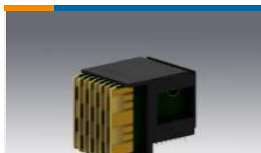
TE Part #1410971-4 MULTIGIG RT T2 7RW H-LFT RTM