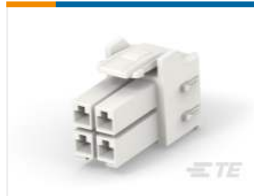
TE Part # 2301329-1 PDL 4P PLUG 3.96MM,DR (GWT)