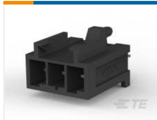
TE Part # 179839-9 AMP POWER D/LOCK T/HDR ASSY 3P