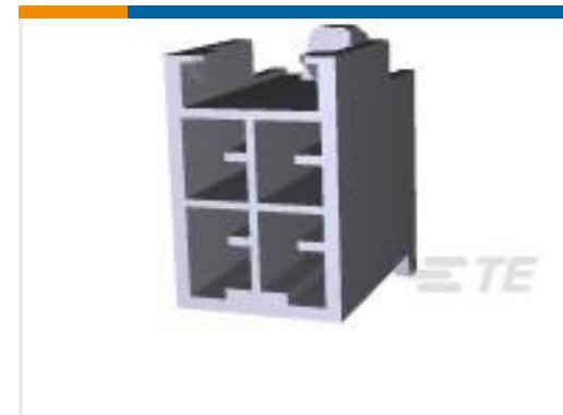
TE Part #179840-6 AMP POWER D/LOCK T/HDR ASSY 4P