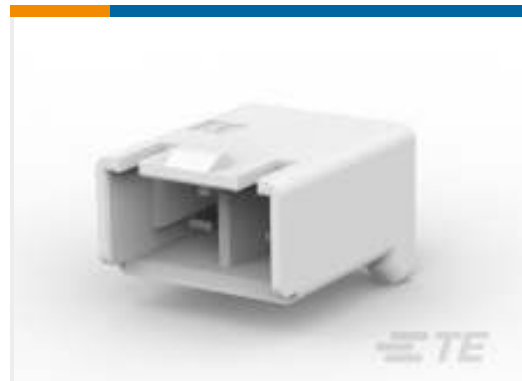
TE Part #2-1376382-3 STD Temp Power Key Header