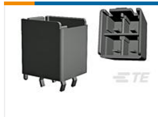
TE Part #1376386-1 5mm B-T-W Conn. 4P(2row) HDR A