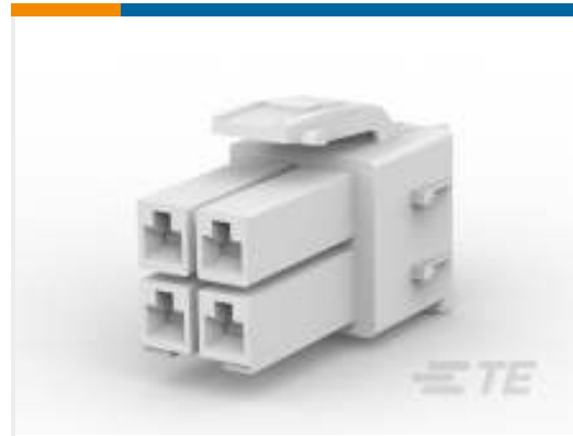
TE Part # CAT-P87024-P729 STD Temp Power Double Lock Plug