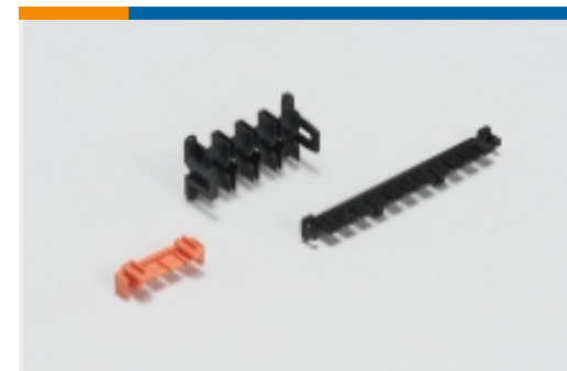
Rectangular Connector Locking(14)