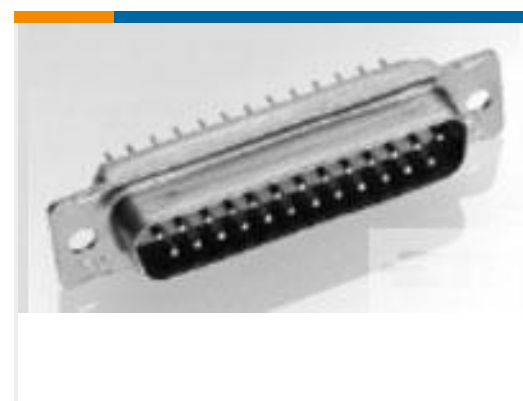
TE Part #1757820-4 AMPLIMITE,ASY,RCPT,STD,109,ZN,4