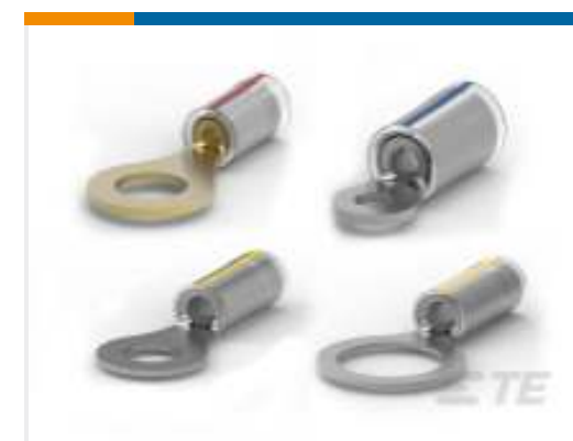
TE Part #53406-1 PIDG Radiation Resistant C Rings /Spades