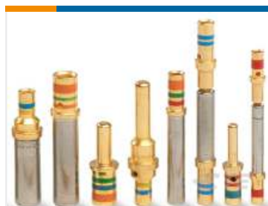
TE Part #38941-22L CONTACTS