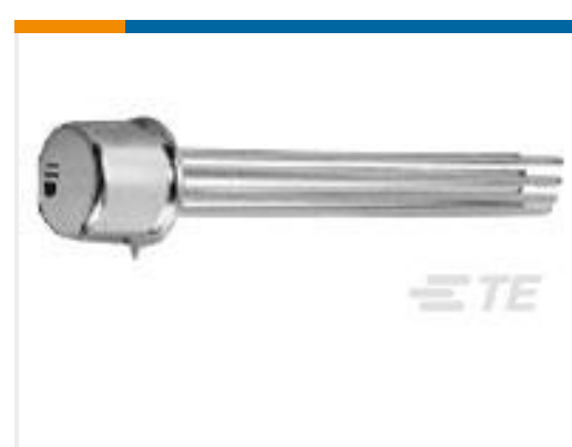
TE Part #1617125-2 JMAW-12XM = M39016/9-016M