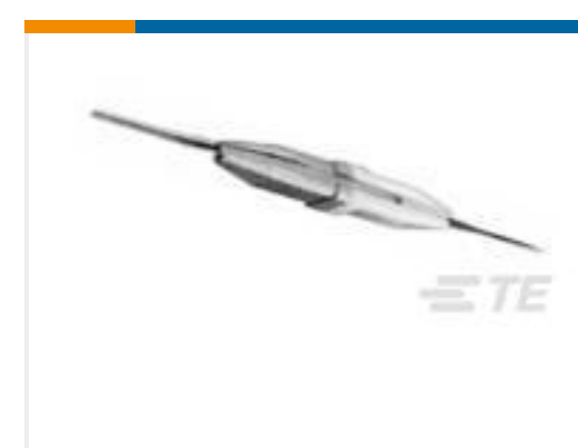
TE Part #91067-1 INSERTION/EXTRACTION TOOL