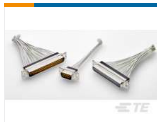
TE Part #2335893-6 AMPLIMITE SZ 5 RECPT 104 POS, ST STL SHL