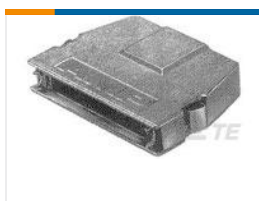
TE Part #749193-1 50 50SR KIT,ST,JK