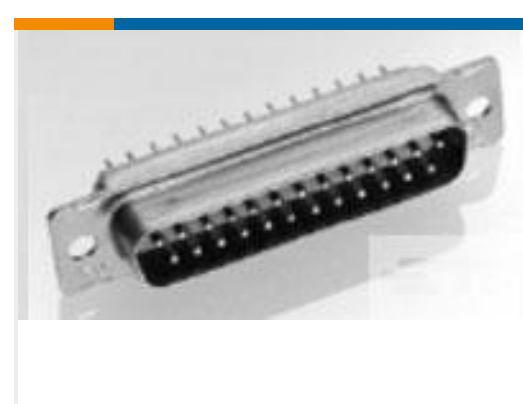
TE Part #206799-1 RECEPT ASSY,15 POSN,AMPLIMITE