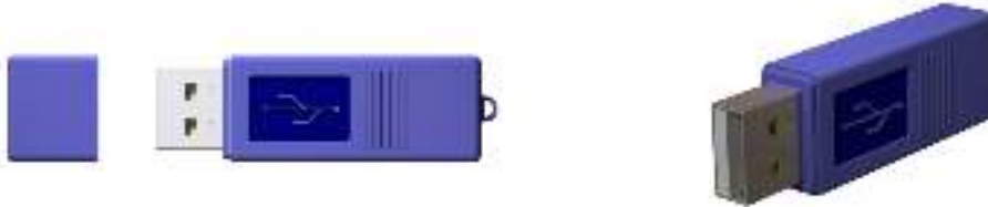
Figure 2.1 FTDI USB Key Illustration.

The following illustration, Figure 2.1 , shows a representation of the FTDI USB Key unit. The user interface is described below.