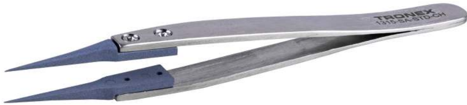
Replacement Tips Item: TIP-STD-15-CH