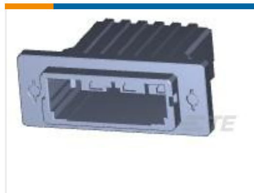
TE Part #1-1747821-3 DYNAMIC D5300 REC HSG 3P/X PM