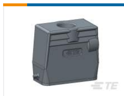
TE Part #T1329100121-000 H10A-TG-PG21