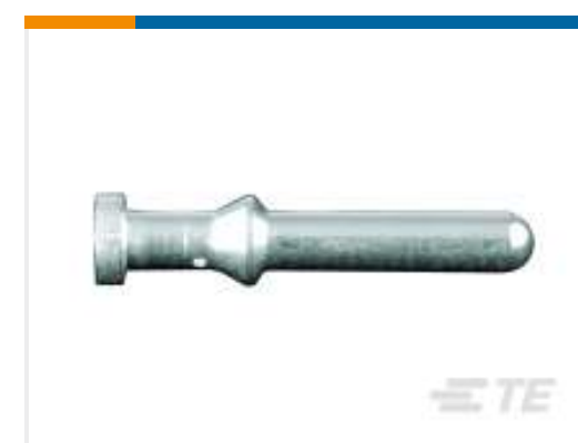
TE Part #T2040001060-000 CMM-6.0