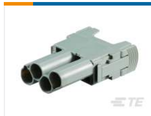
TE Part #T2111042101-000 HMN-004-M