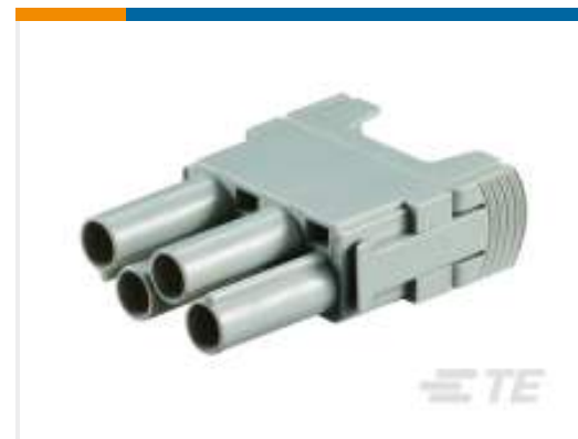
TE Part #T2111042201-000 HMN-004-F