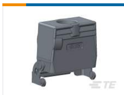
TE Part #T1739101116-000 H10A-TBFS-PG16