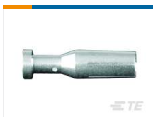
TE Part #T2040002100-000 CMF-10