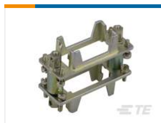
TE Part #T2079104101-000 H10A-T1-M