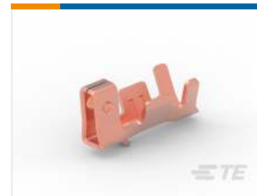
TE Part #2174065-4 REC. CONT. FMG. M-MOTOR PLUS