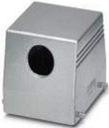
HEAVYCON sleeve housing D50, for double locking latch, height 76 mm, without support 1x M25, lateral conductor exit

Please be informed that the data shown in this PDF Document is generated from our Online Catalog. Please find the complete data in the user's documentation. Our General Terms of Use for Downloads are valid ( http://phoenixcontact.com/download )