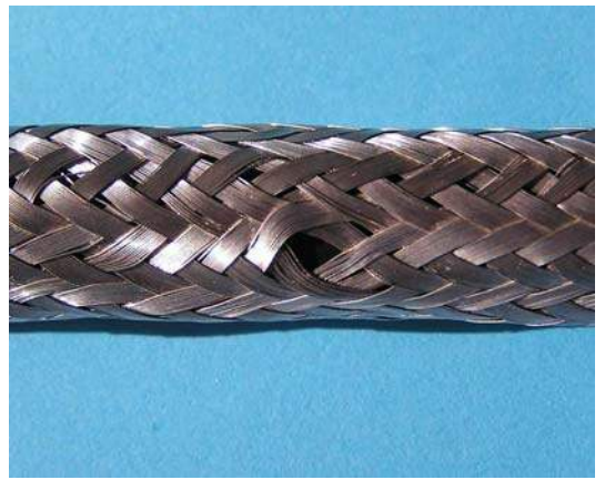
NOTACCEPTABLE Window in Shield