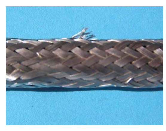
NOTACCEPTABLE Damaged and Nicked Conductors