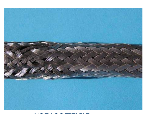
NOTACCEPTABLE Uneven Coverage