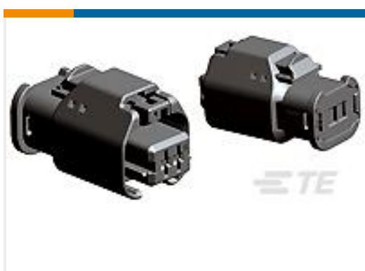
TE Part #1801175-1 2W RECEPTACLE HP CONNECTOR BLACK