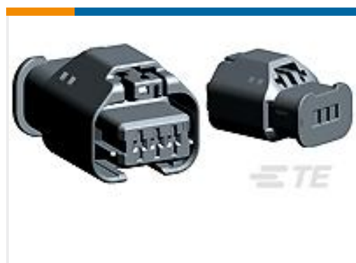
TE Part #1801178-1 3W RECEPTACLE HP CONNECTOR BLACK