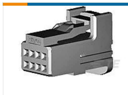
TE Part #1379659-3 8W PLUG HOUSING ASSY BLUE