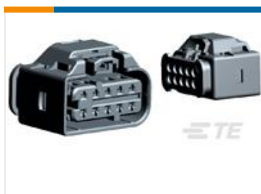
TE Part #1801600-2 RECEPTACLE HOUSING, MCON, 10 W, SEALED