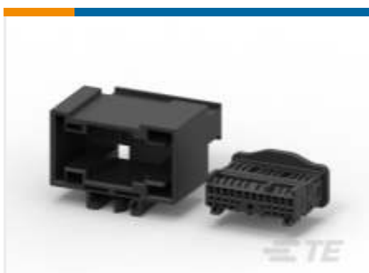
TE Part #953697-1 MQS, CONNECTOR HOUSING