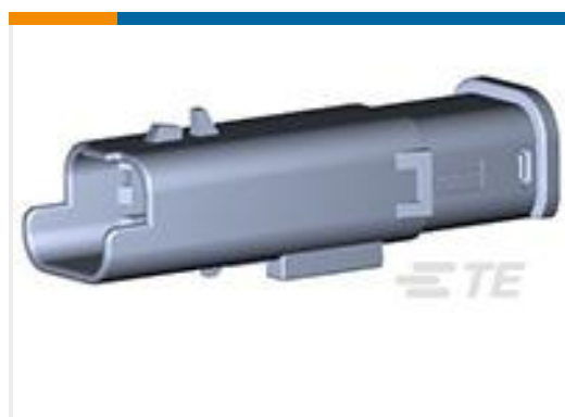
TE Part #1801174-1 2W TAB HP CONNECTOR BLACK