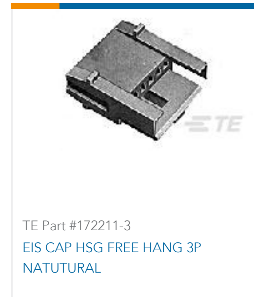
TE Part #172211-3 EIS CAP HSG FREE HANG 3P NATUTURAL