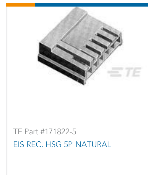
TE Part #171822-5 EIS REC. HSG 5P-NATURAL