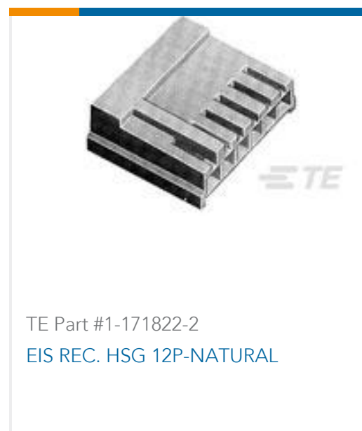
TE Part #1-171822-2 EIS REC. HSG 12P-NATURAL