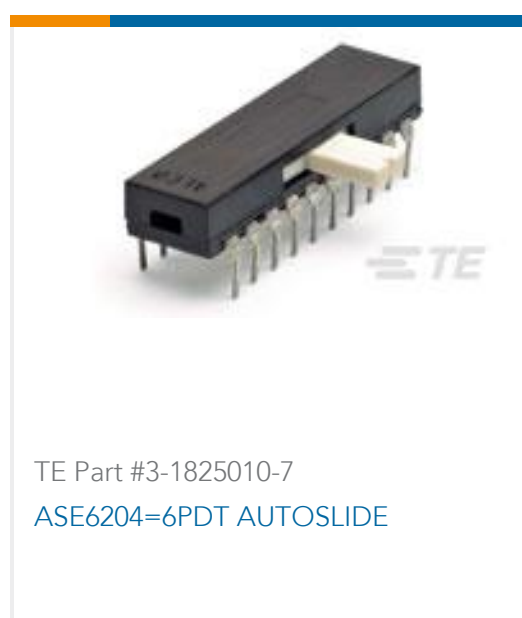
TE Part #3-1825010-7 ASE6204=6PDT AUTOSLIDE