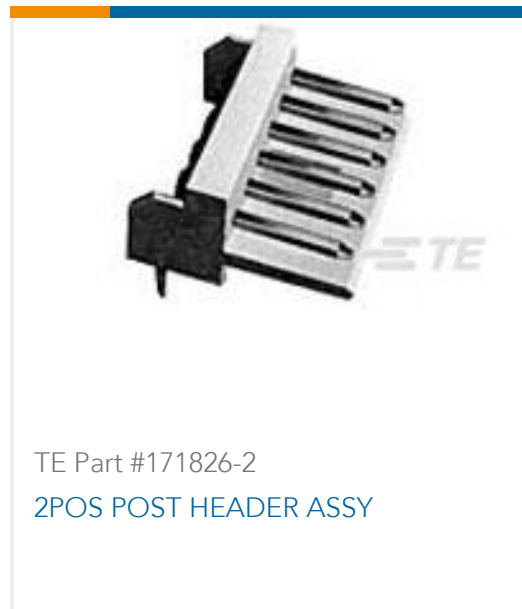
TE Part #171826-2 2POS POST HEADER ASSY