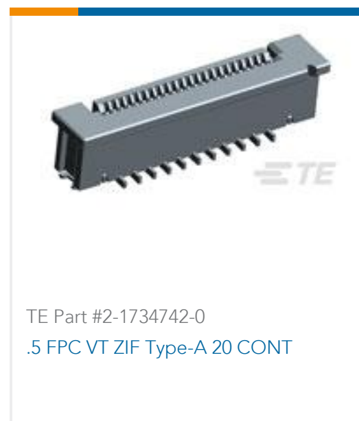
TE Part #2-1734742-0 .5 FPC VT ZIF Type-A 20 CONT