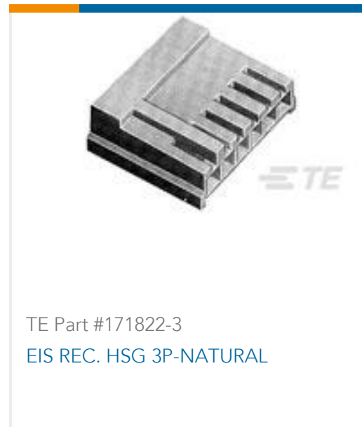
TE Part #171822-3 EIS REC. HSG 3P-NATURAL