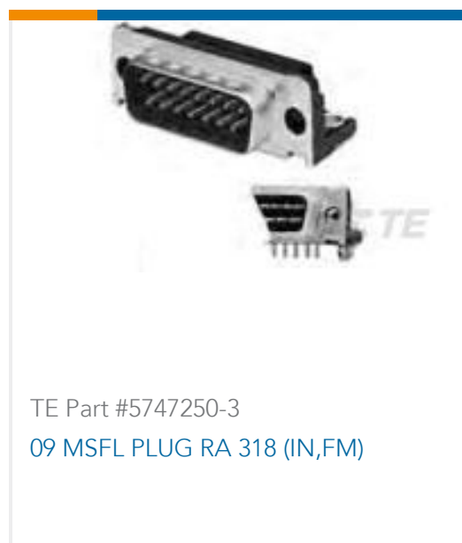
TE Part #5747250-3 09 MSFL PLUG RA 318 (IN,FM)