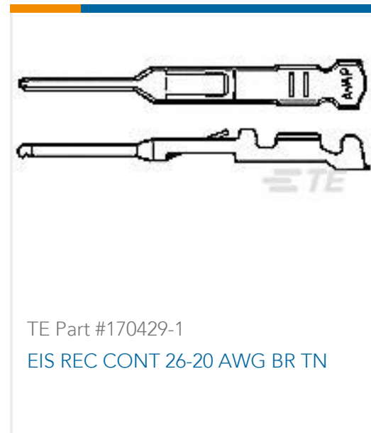
TE Part #170429-1 EIS REC CONT 26-20 AWG BR TN