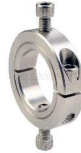
*Additional hardware #01 included