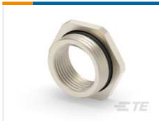
TE Part #T3071252050-000 REDU-25/20-M