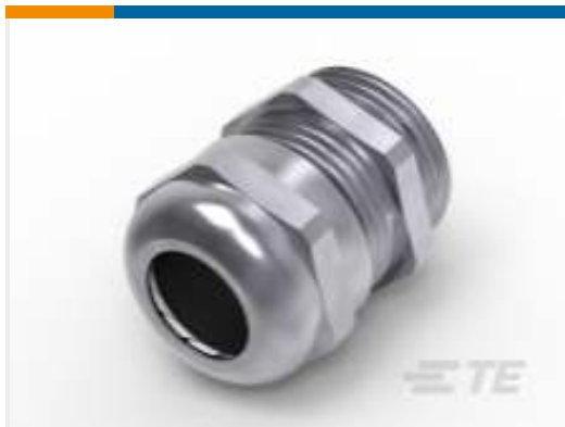
TE Part #T3609160102-000 DLX-16-M (4-8)