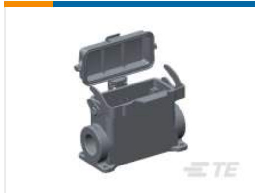
TE Part #T1660163129-000 H16B-SDRH-LB-PG29