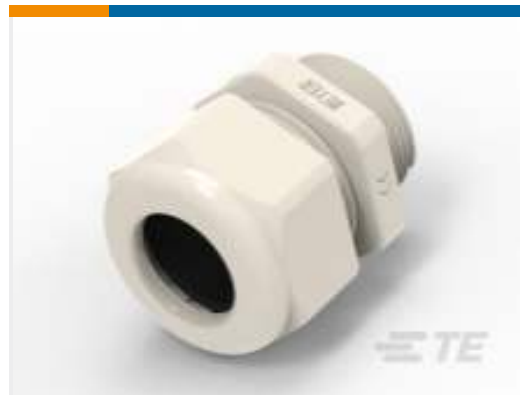
TE Part #T3209251212-001 HSK-M25G-H