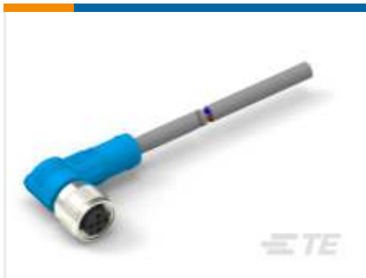
TE Part #T4151420004-004 M12 A-Code Pigtail, Female, R/A, Single Ended Cable