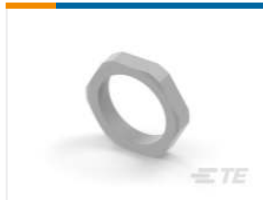
TE Part #T3262250050-000 LN-25-PM