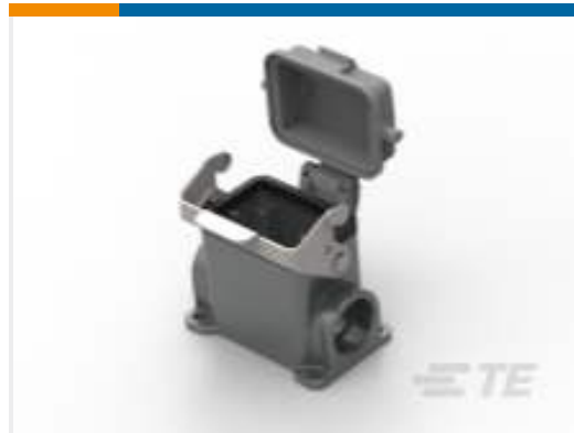
TE Part #T1620063121-000 H6B-SDR-PG21