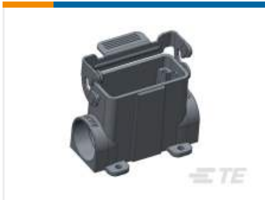
TE Part #T1619101116-000 H10A-SGRS-PG16