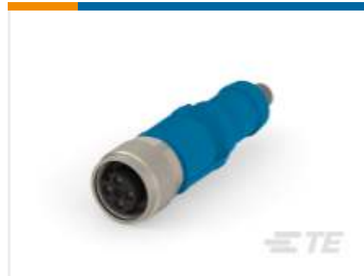
TE Part #T4151320004-003 RPC-M12-FS-4CON-PUR-1.5