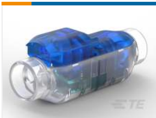
TE Part # 2213800-2 COOLSPICE NEW STANDARD