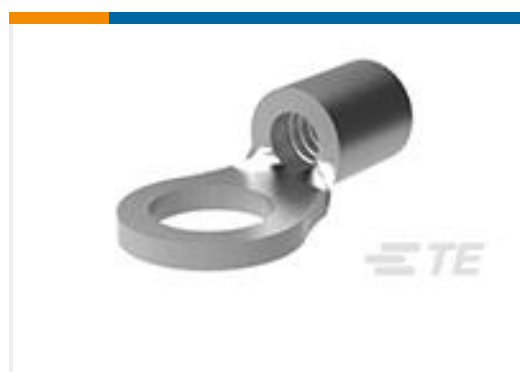
TE Part #32994 TERMINAL, SOLIS R 12-10 8