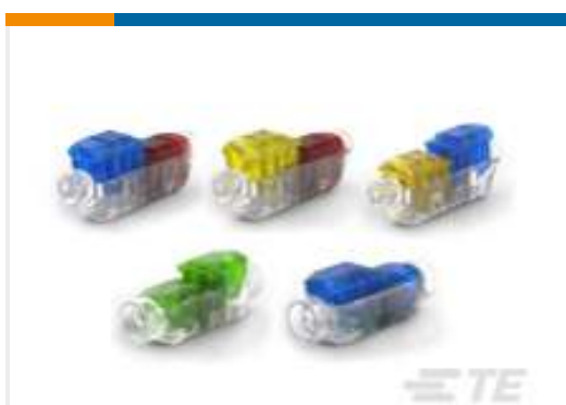
TE Part #2213600-3 CoolSplice Quick Connect Splice