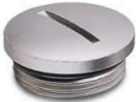
Cover caps, for Pg screw connections, type Pg29

Please be informed that the data shown in this PDF Document is generated from our Online Catalog. Please find the complete data in the user's documentation. Our General Terms of Use for Downloads are valid ( http://download.phoenixcontact.com )