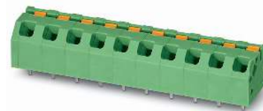
The figure shows 10-pos. standard item (without EX marking)

PCB terminal block, Push-in spring connection