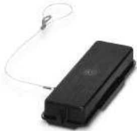
HEAVYCON protective cover, B24, for HC-EVO-B24... supporting base element, for single locking latch, with retaining cord with combination eyelet, IP54

Please be informed that the data shown in this PDF Document is generated from our Online Catalog. Please find the complete data in the user's documentation. Our General Terms of Use for Downloads are valid ( http://phoenixcontact.com/download )