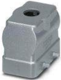
HEAVYCON B10 sleeve housing, for double locking latch, height: 72 mm, with 1 x M32 thread, straight cable outlet

Please be informed that the data shown in this PDF Document is generated from our Online Catalog. Please find the complete data in the user's documentation. Our General Terms of Use for Downloads are valid ( http://download.phoenixcontact.com )