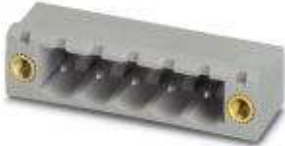
The figure shows a 5-pos. version of the product in gray

Header, Nominal current: 12 A, Rated voltage (III/2): 320 V, Number of positions: 16, Pitch: 5.08 mm, Color: black, Contact surface: Tin, Mounting: Wave soldering