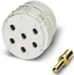
Contact insert, Number of positions: 6, Type of contact: Male connector, Crimp connection

Please be informed that the data shown in this PDF Document is generated from our Online Catalog. Please find the complete data in the user's documentation. Our General Terms of Use for Downloads are valid ( http://phoenixcontact.com/download )