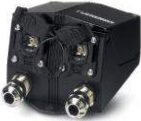
Terminal outlet SC-RJ IP65/67, 2 slots version 6, with protective plugs, 2 cable entries

Please be informed that the data shown in this PDF Document is generated from our Online Catalog. Please find the complete data in the user's documentation. Our General Terms of Use for Downloads are valid ( http://phoenixcontact.com/download )