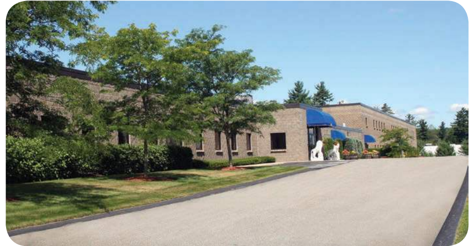
Advanced Cable Ties, Inc. corporate headquarters and manufacturing facility in Gardner, Massachusetts.

We invite you to meet with our team, visit our website, tour our USA manufacturing operation, or request samples of our products. We are confident you will be completely satisfied with every aspect of your experience with Advanced Cable Ties.