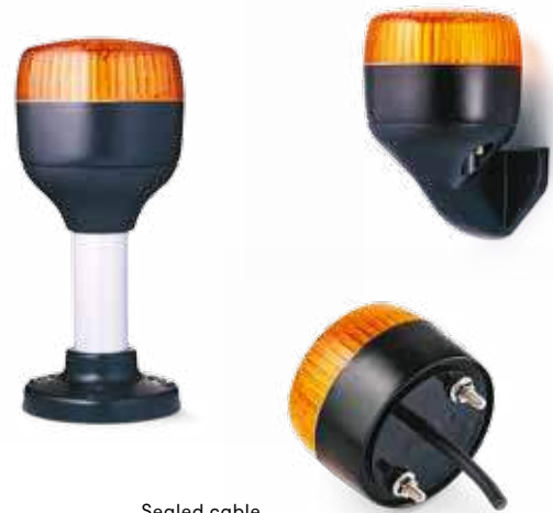
Sealed cable insulation/entry