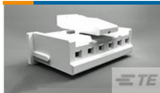
TE Part #1969442-5 EP 2.5 TPA Housing, 5 Pos