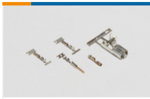
Wire-to-Board Connector Contacts(6)