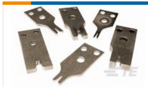
TE Part #7-1633588-1 CRIMPER, WIRE 'F' .050