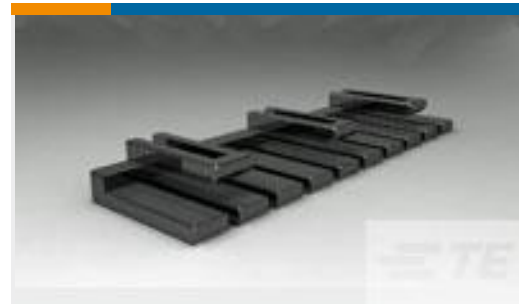
TE Part #1969443-4 EP 2.5 TPA Retainer, 4 Pos