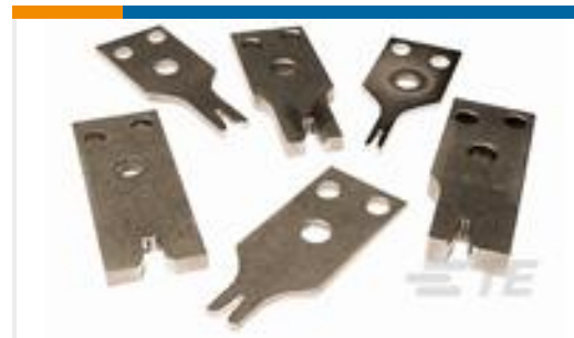
TE Part #6-1633961-6 CRIMPER, INSULATION F PREMIUM