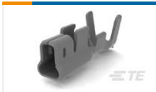
TE Part #2110989-1 EP 2.5 RCPT CONTACT, 26-22 AWG