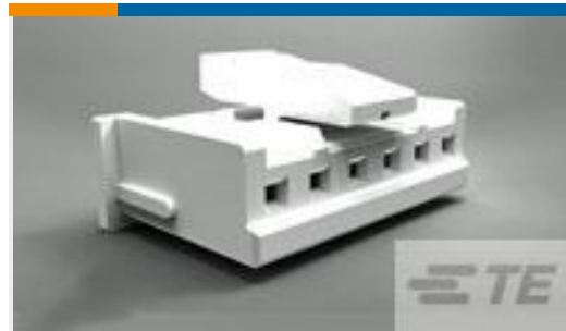
TE Part #1969442-4 EP 2.5 TPA Housing, 4 Pos