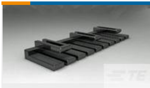
TE Part #1969443-5 EP 2.5 TPA Retainer, 5 Pos