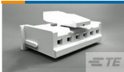
TE Part #1969442-7 EP 2.5 TPA Housing, 7 Pos