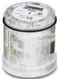
Flashing beacon element, 24 V DC, clear, Xenon flash tube

Please be informed that the data shown in this PDF Document is generated from our Online Catalog. Please find the complete data in the user's documentation. Our General Terms of Use for Downloads are valid ( http://phoenixcontact.com/download )