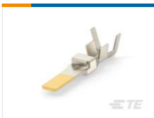
TE Part #917805-3 Contact: Component To Wire ; 20-45A , 20-8 wire size