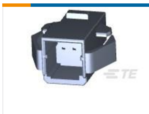
TE Part #1-1903131-3 DYNAMIC 1200D TAB HSG 6P P/M