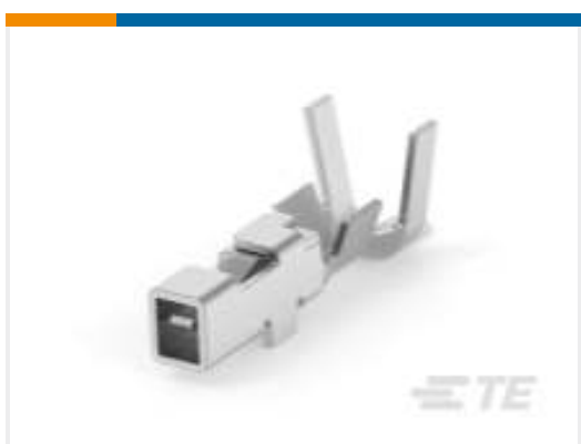
TE Part #1903124-1 Contact: Component To Wire; 3-5A, 30-18 Wire Size