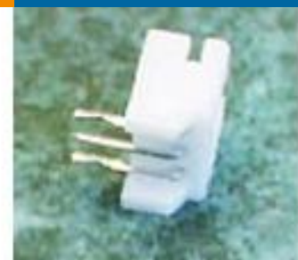
TE Part #440055-5 2.0MM,HDR,5POS,R/A