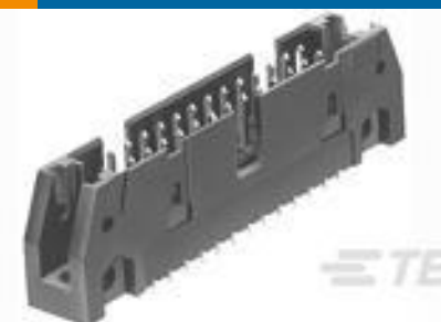
TE Part #5102154-3 A/L UNIV HDR 16P VERT