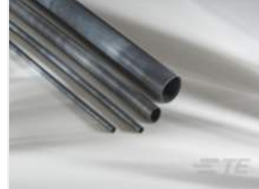
TE Part #EH2293-000 DWFR-24/8-0-STK