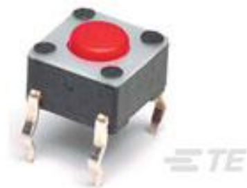
TE Part #1825910-6 FSM4JH=6MM TACT SWITCH, HIGH TEMP