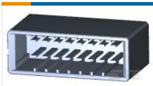
TE Part #178327-5 DYNAMIC D/ROW HDR 16P V ASSY