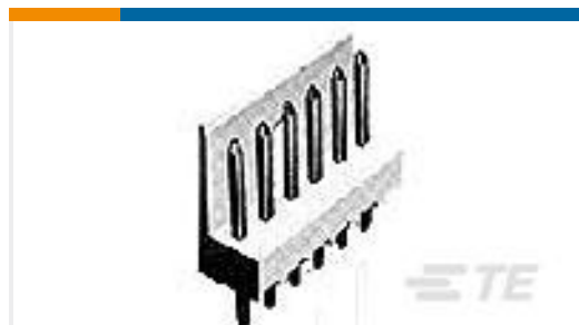
TE Part #1-171825-2 POST HDR ASSY VERT AMP EI CONN