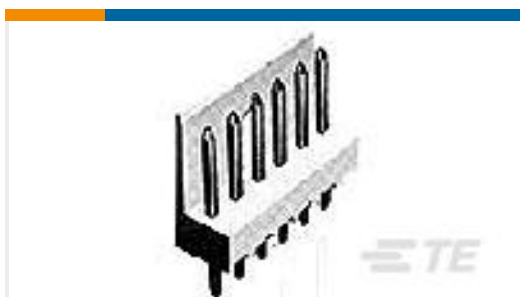
TE Part #171825-7 V-TYPE E.I.S.CONN. 7P ASSY