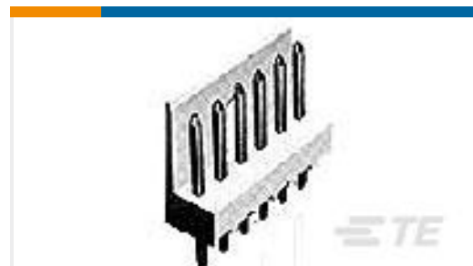
TE Part #171825-5 5 POS EIS POST HDR