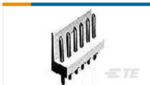
TE Part #171825-9 9P EIS POST HDR VERTICAL