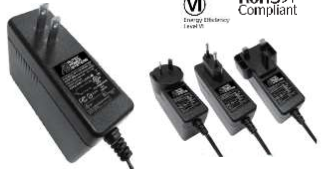
*Product images are for illustrative purposes only and may vary from actual design.