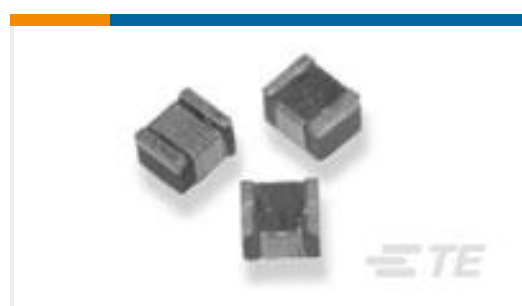
TE Part #2-2176086-2 3654 0402 12nH 5% 2K RL