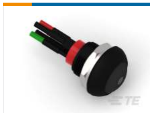
TE Part #2329389-4 PB OFF/ON FC BLK M1 TERM GRE LED IP68 50