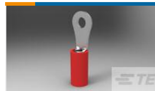
TE Part #171505-1 PIDG RING UL.CSA(22-18)