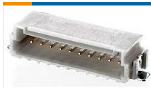
TE Part #292227-6 1.5 MINI CT SGL H SMT W BOSS 6