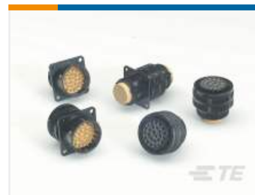
TE Part #ZPF00000000018067 FDBA 50-14-12 PN-K 090 A499