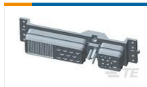
TE Part #1996090-1 A600,PLUG ASSY,SZ 2,150/11Q11 /13C2 RR