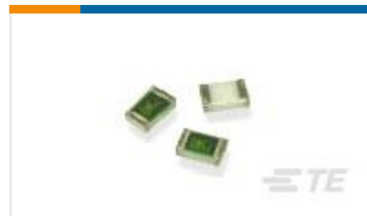
TE Part #1-2176087-5 RP 1J 0.166W 95R3 0.1% 25PPM 1K RL