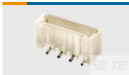
TE Part #1-292230-6 1.5 MINI CT SGL V SMT W/BOSS 1