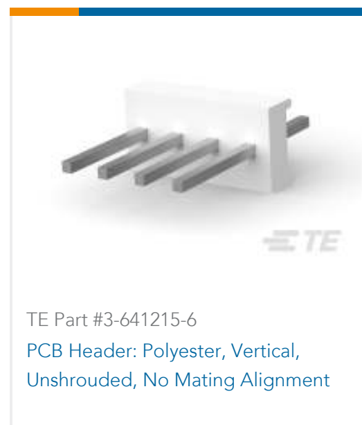
TE Part #3-641215-6 PCB Header: Polyester, Vertical, Unshrouded, No Mating Alignment