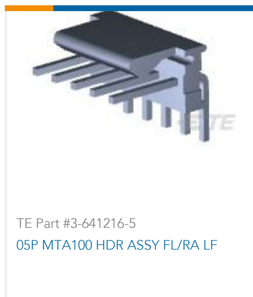
TE Part #3-641216-5 05P MTA100 HDR ASSY FL/RA LF