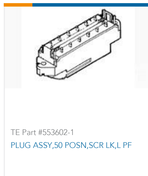
TE Part #553602-1 PLUG ASSY,50 POSN,SCR LK,L PF