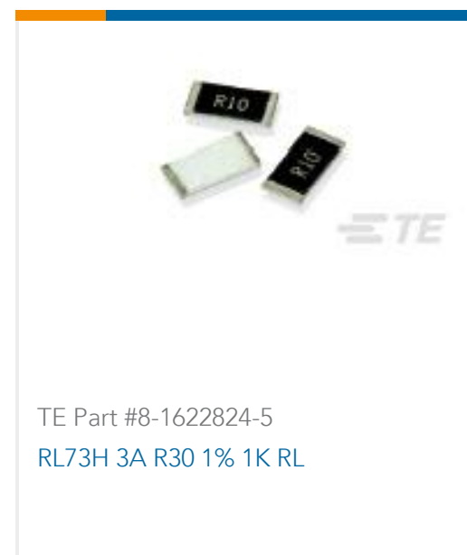
TE Part #8-1622824-5 RL73H 3A R30 1% 1K RL