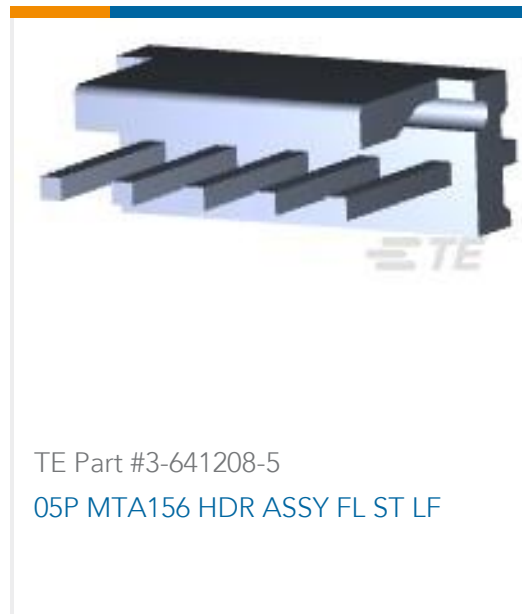
TE Part #3-641208-5 05P MTA156 HDR ASSY FL ST LF