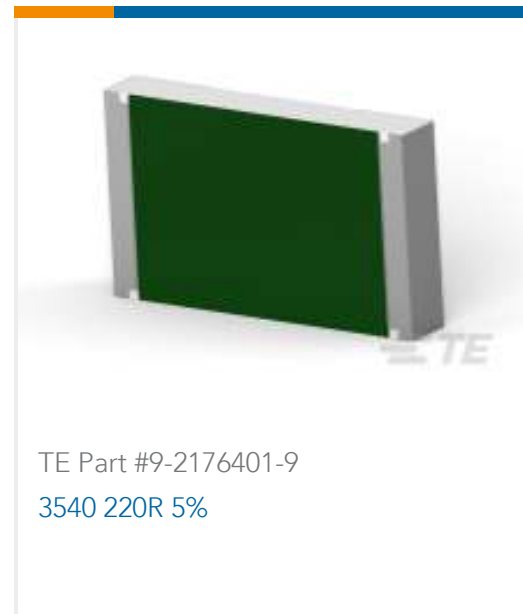
TE Part #9-2176401-9 3540 220R 5%