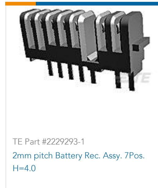
TE Part #2229293-1 2mm pitch Battery Rec. Assy. 7Pos. H=4.0