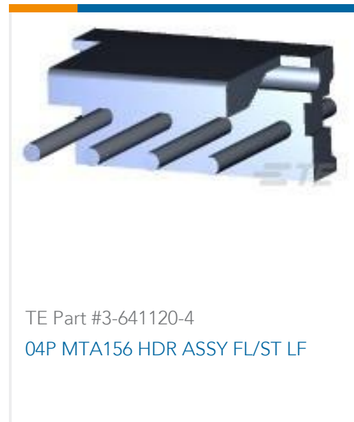
TE Part #3-641120-4 04P MTA156 HDR ASSY FL/ST LF