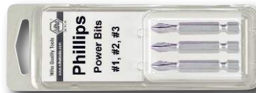
741 50 Phillips Power Bit Packs, 2" CVM

S2 modified tool steel. Extra hard with natural finish. Exact fit machined tips. 3 pc. bit pack.