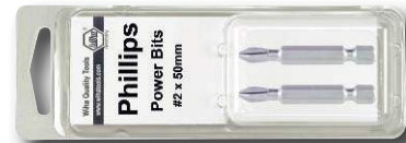
711 Phillips Long Insert Bits