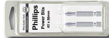
741 Phillips Power Bit Packs, 2" CVM S2 modified tool steel.