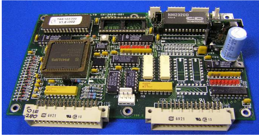
GENERIC CONTROLLER PCB