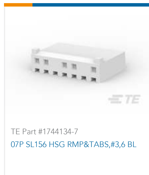
TE Part #1744134-7 07P SL156 HSG RMP&TABS,#3,6 BL