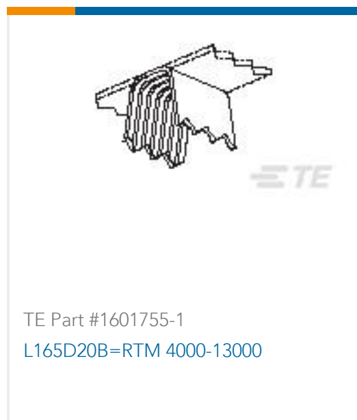
TE Part #1601755-1 L165D20B=RTM 4000-13000