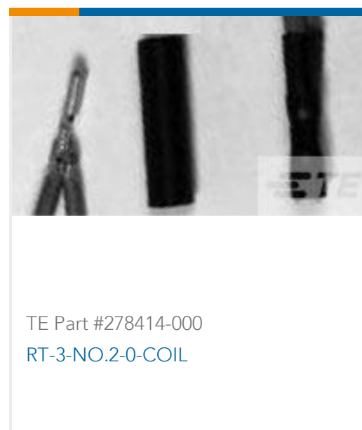
TE Part #278414-000 RT-3-NO.2-0-COIL