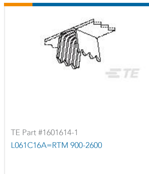
TE Part #1601614-1 L061C16A=RTM 900-2600