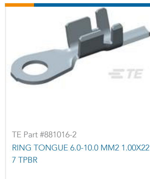
TE Part #881016-2 RING TONGUE 6.0-10.0 MM2 1.00X22.7 TPBR