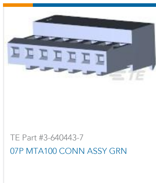
TE Part #3-640443-7 07P MTA100 CONN ASSY GRN