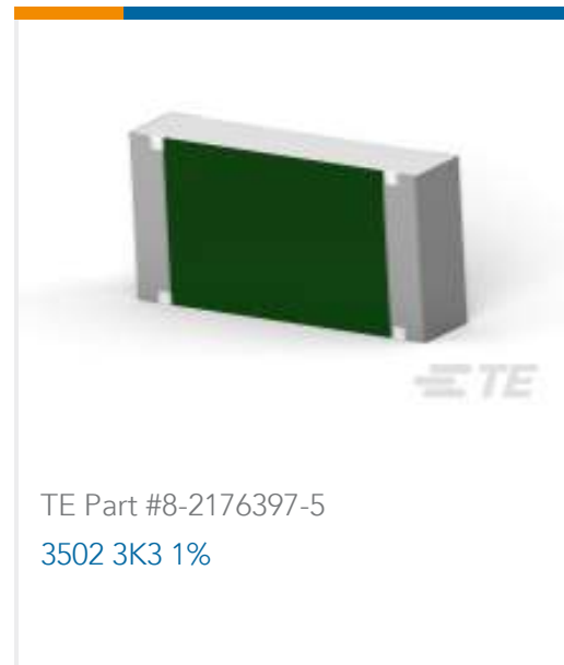
TE Part #8-2176397-5 3502 3K3 1%