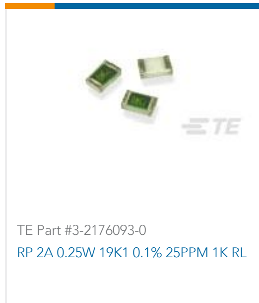
TE Part #3-2176093-0 RP 2A 0.25W 19K1 0.1% 25PPM 1K RL