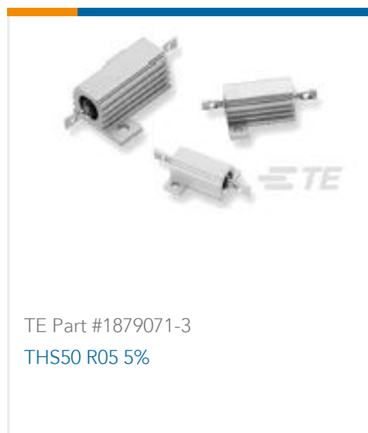
TE Part #1879071-3 THS50 R05 5%