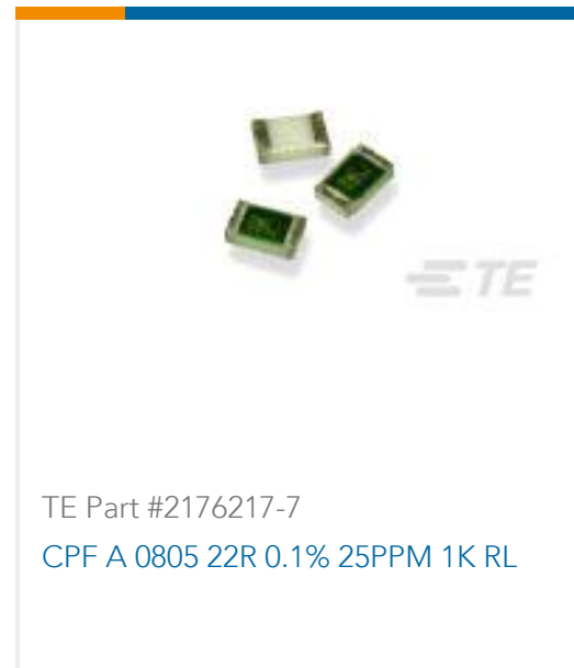
TE Part #2176217-7 CPF A 0805 22R 0.1% 25PPM 1K RL