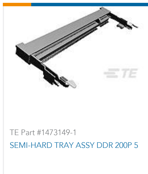
TE Part #1473149-1 SEMI-HARD TRAY ASSY DDR 200P 5