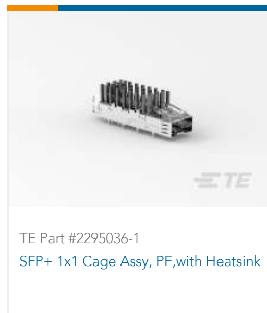
TE Part #2295036-1 SFP+ 1x1 Cage Assy, PF,with Heatsink