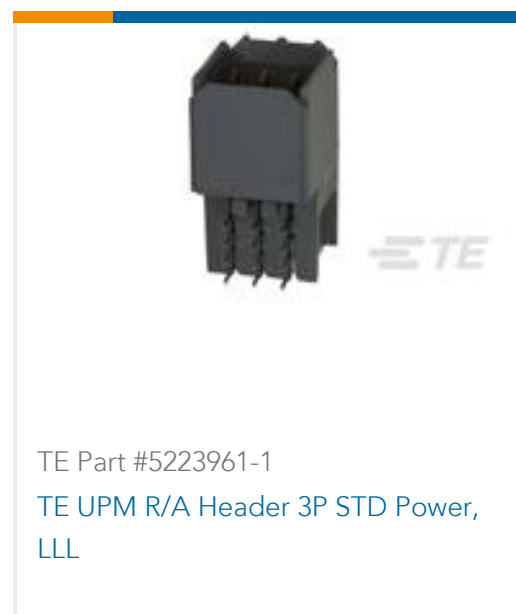
TE Part #5223961-1 TE UPM R/A Header 3P STD Power, LLL