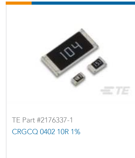
TE Part #2176337-1 CRGCQ 0402 10R 1%