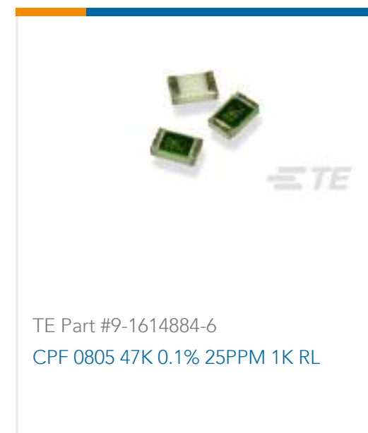
TE Part #9-1614884-6 CPF 0805 47K 0.1% 25PPM 1K RL