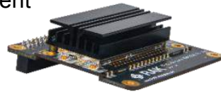
RAK2245 Pi HAT (1x)