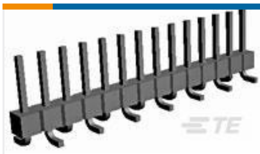
TE Part #5-146132-1 03 MODII HDR SR SFMNT B/A .100