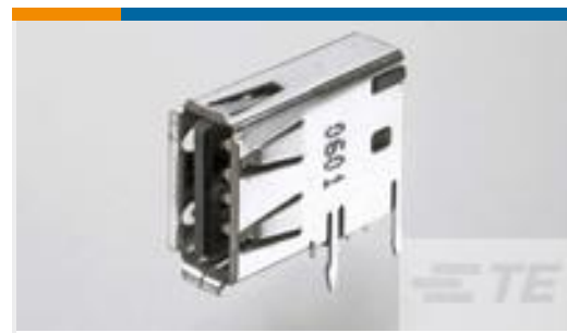
TE Part #292336-1 Std USB Type A, Flag, T/H