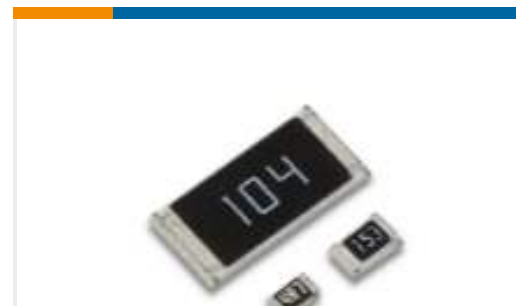
TE Part #4-2176343-0 CRGQ 1206 18K 1%