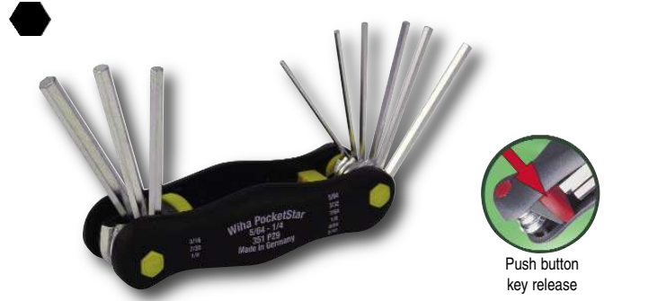
Push button key release

351 96 7 Pc. Metric Hex PocketStar Fold Outs High alloy CVM steel, hardened, molded ergonomic handle. Item No 351 96 PocketStar lbs. .31 Metric: 1.5, 2.0, 2.5, 3.0, 4.0, 5.0, 6.0mm