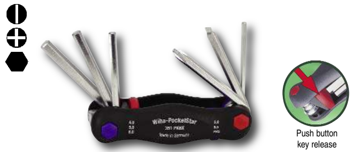
Push button key release

351 97 9 Pc. Inch Hex PocketStar Fold Outs High alloy CVM steel, hardened, molded ergonomic handle. Item No 351 97 PocketStar lbs. .47 SHOP Inch: 5/64, 3/32, 7/64, 1/8, 9/64, 5/32, 3/16, 7/32, 1/4"