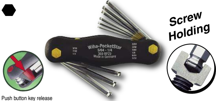
Push button key release

369 97 9 Pc. MagicRing Inch PocketStar Fold Outs High alloy CVM steel, hardened, molded ergonomic handle. Item No 369 97 PocketStar lbs. .46 SHOP Inch: 5/64*, 3/32*, 7/64*, 1/8, 9/64, 5/32, 3/16, 7/32, 1/4"