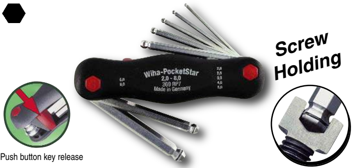
Push button key release

369 96 7 Pc. MagicRing Metric PocketStar Fold Outs High alloy CVM steel, hardened, molded ergonomic handle. Item No 369 96 PocketStar lbs. .50 SHOP Metric: 2.0*, 2.5*, 3.0, 4.0, 5.0, 6.0, 8.0mm