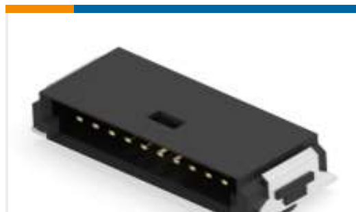
TE Part #234464-E SRCA 1,27 10 M 1 SMD 137 E1 094 * GURT *