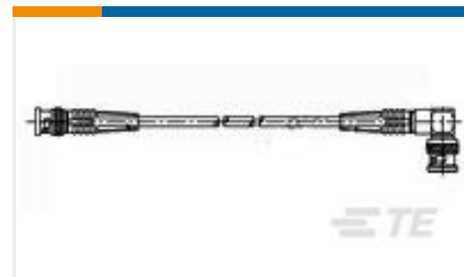
TE Part #1337772-1 50/OHM COAX BNC STR PLUG-ELB P