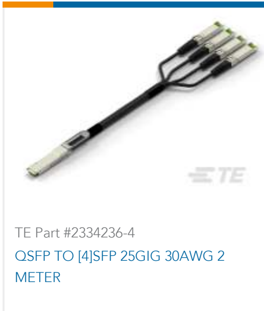
TE Part #2334236-4 QSFP TO [4]SFP 25GIG 30AWG 2 METER