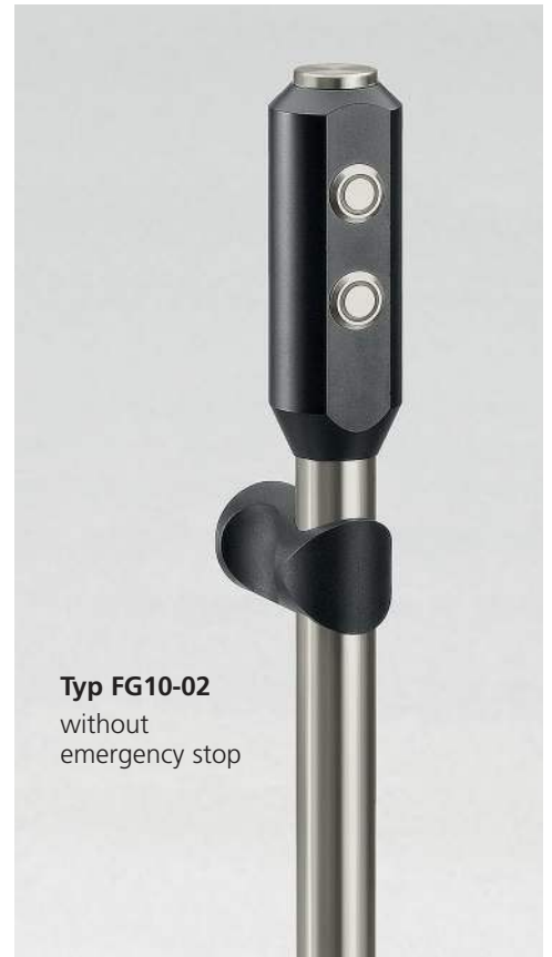
Typ FG10-02 without emergency stop