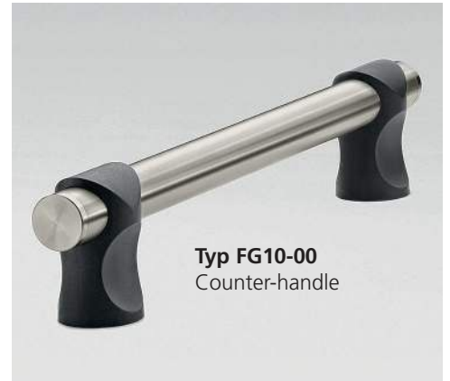
Typ FG10-00 Counter-handle