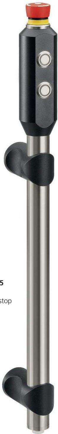
Typ FG10-05 with emergency stop