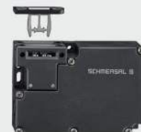
Door solenoid tumbler see page 304–305.