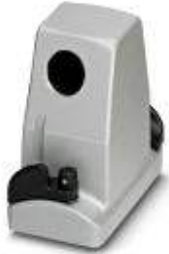
HEAVYCON ADVANCE EMV sleeve housing B10, with bayonet locking, height 100 mm, with 1xM32 thread, lateral cable outlet

Please be informed that the data shown in this PDF Document is generated from our Online Catalog. Please find the complete data in the user's documentation. Our General Terms of Use for Downloads are valid ( http://download.phoenixcontact.com )